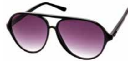
LOS COCOS 06622011 BLACK SMOKE GRAD