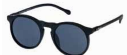
BOJANGLES 09391011 MATTE BLACK SMOKE MONO