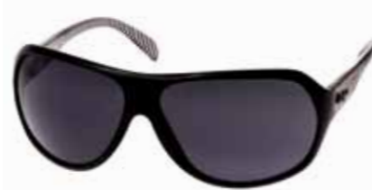
LIQUID TEXTA 09900011 BLACK | CRYSTAL VERTICAL STRIPE SMOKE MONO