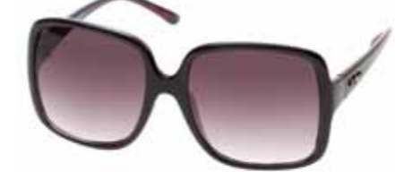
JUNGLE GOSSIP 09394011 BLACK | RED & BLUE ZEBRA SMOKE GRAD