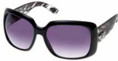
BISCAYNE 1002407 BLACK | MIDNIGHT TORT SMOKE GRAD