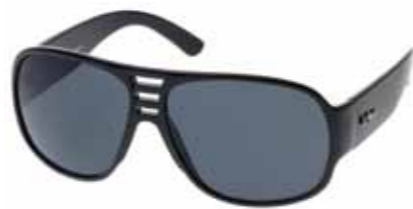
MIAMI NIGHTS 1002412 BLACK SMOKE MONO