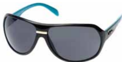
LIQUID TEXTA 1002411 BLACK | ELECTRIC BLUE SPLASH | SILVER SMOKE MONO