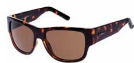
JETSON 09388010 DARK TORT BROWN MONO