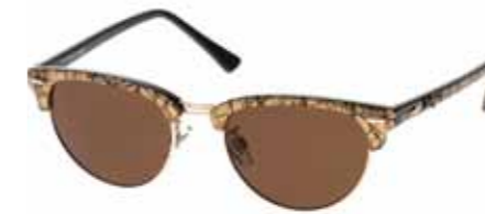
ART DECO 1002422 ANTIQUÉ GOLD BROWN MONO