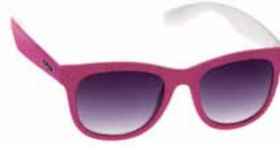
RIGHT VIEW THE REVOLVER 1002405 SUNSET SMOKE GRAD LENTICULAR COLOUR CHANGING FRAME