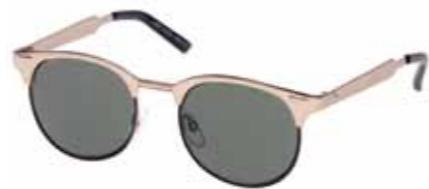
LOST BOYS 1002413 MATTE GOLD | MATTE BLACK GREEN MONO