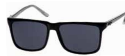
COSMIC STRING 08804011 BLACK | CRYSTAL VERTICAL STRIPE SMOKE MONO