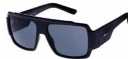
SPACE NEIGHBOUR 09387011 BLACK | NAVY SMOKE MONO