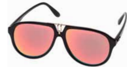
ELMO'S FIRE 09373019 BLACK | GOLD RED REVO MIRROR