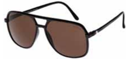
LORD CURIOUS 09385080 BROWN GALAXY BROWN MONO LE FINE