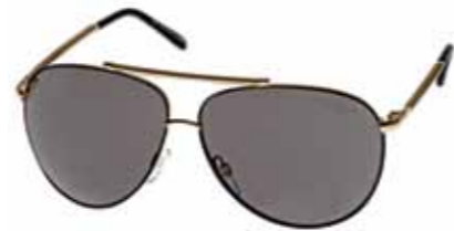
TIME MACHINE 08813011 BLACK | GOLD SMOKE MONO