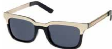
GOLD FEVER 1002406 BLACK | MATTE GOLD SMOKE MONO