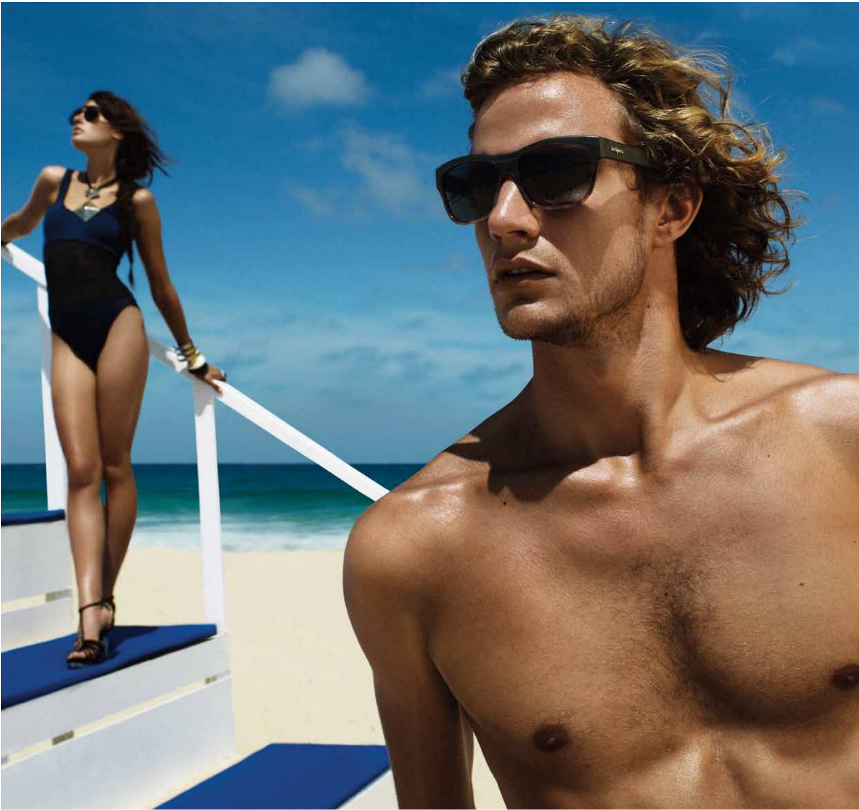
FROM LEFT: ACID DOUBLE | AL CAPONE