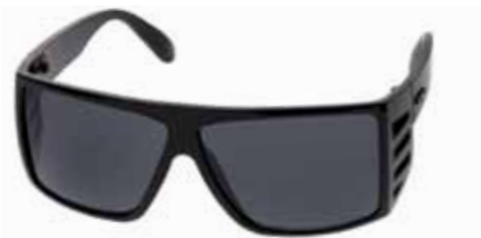
CRYSTAL LIZARD 09396011 BLACK SMOKE MONO