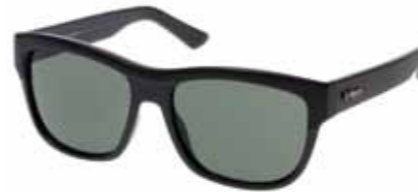
AL CAPONE 1002424 BLACK | MATTE BLACK GREEN MONO