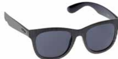
RIGHT VIEW THE REVOLVER 1002403 IRON SMOKE MONO LENTICULAR COLOUR CHANGING FRAME