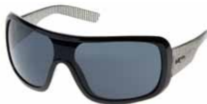
TECH INVASION 1002410 BLACK | CRYSTAL VERTICAL STRIPE SMOKE MONO