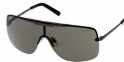
AFTER DARK 1002421 IRON SMOKE MONO