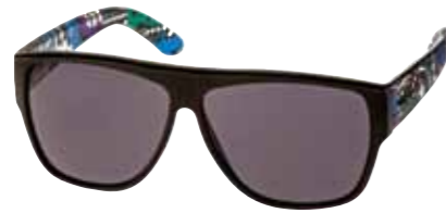
NU-RO SCENESTER 07700011 BLACK | 80'S PATTERN SMOKE MONO