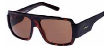
SPACE NEIGHBOUR 09387080 TORT | BLACK BROWN MONO