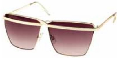
ANGULAR SYMPHONY 1002418 GOLD BROWN GRAD