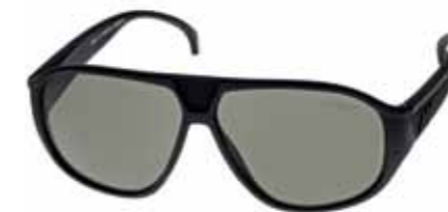
FAST & FAMOUS 08809012 MATTE BLACK GREEN MONO