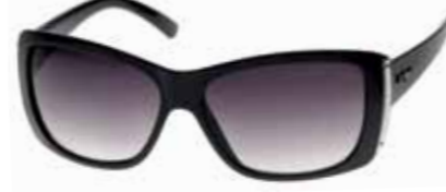
BREAKFAST CLUB 08818016 BLACK | SILVER KHAKI GRAD