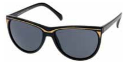
SWEET DISPOSITION 1002409 BLACK | GOLD SMOKE MONO