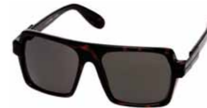
OVEREXPOSED 1002429 DARK TORT | MATTE BLACK SMOKE MONO