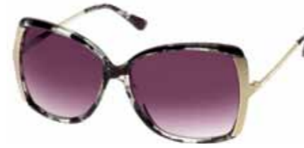
DE VILLE 1002427 MIDNIGHT TORT | GOLD WARM SMOKE GRAD