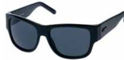
JETSON 09388011 BLACK SMOKE MONO