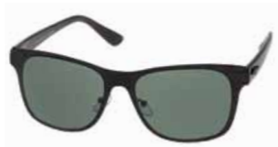
MOON ROCKS 09380012 BLACK GREEN MONO