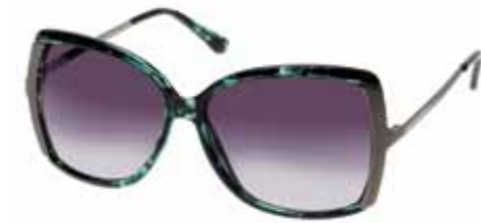
DE VILLE 1002426 TURQUOISE TORT | GUNMETAL KHAKI GRAD