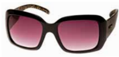
GLAMROCK 07713011 BLACK | GOLD BAMBOO WARM SMOKE GRAD