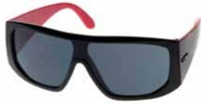
PANIC STATION 1002400 BLACK | ELECTRIC MELON SPLASH SMOKE MONO