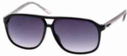
TOKYO HOTEL 08816011 BLACK | ORANGE PATTERN SMOKE GRAD