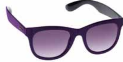
RIGHT VIEW THE REVOLVER 1002404 PEACOCK SMOKE GRAD LENTICULAR COLOUR CHANGING FRAME