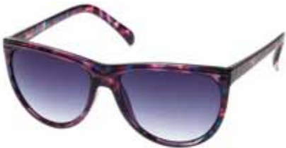
SWEET DISPOSITION 1002408 BERRY TORT SMOKE GRAD