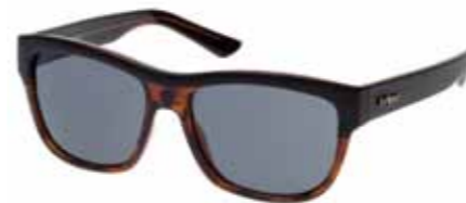
AL CAPONE 1002423 TORT | MATTE BLACK SMOKE MONO