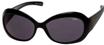
GOA 06613011 BLACK SMOKE MONO