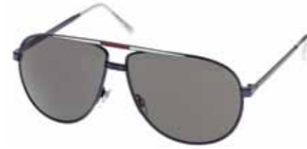
SCARFACE 1002417 NAVY | RED & WHITE EPOXY SMOKE MONO