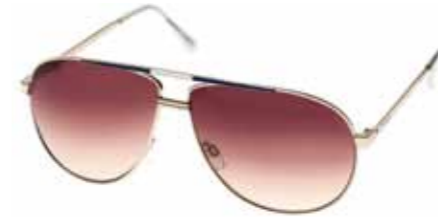
SCARFACE 1002416 GOLD | NAVY & WHITE EPOXY BROWN GRAD