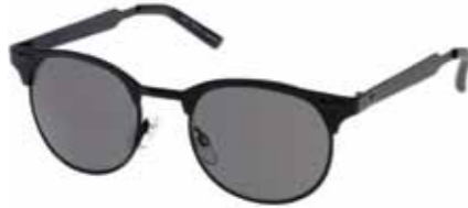
LOST BOYS 1002414 MATTE BLACK SMOKE MONO