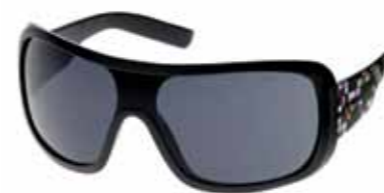
TECH INVASION 08800011 BLACK | SPACE PATTERN SMOKE MONO