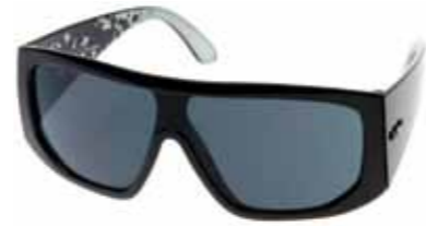
PANIC STATION 1002401 BLACK | CRYSTAL CHARCOAL SPLASH SMOKE MONO