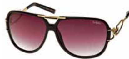
GARAGE OASIS 07712011 BLACK | GOLD WARM SMOKE GRAD