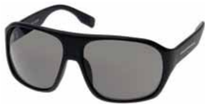
CONGA LINE 1002420 MATTE BLACK SMOKE MONO