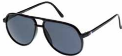
SIR MARVELOUS 09384011 BLACK SMOKE MONO LE FINE