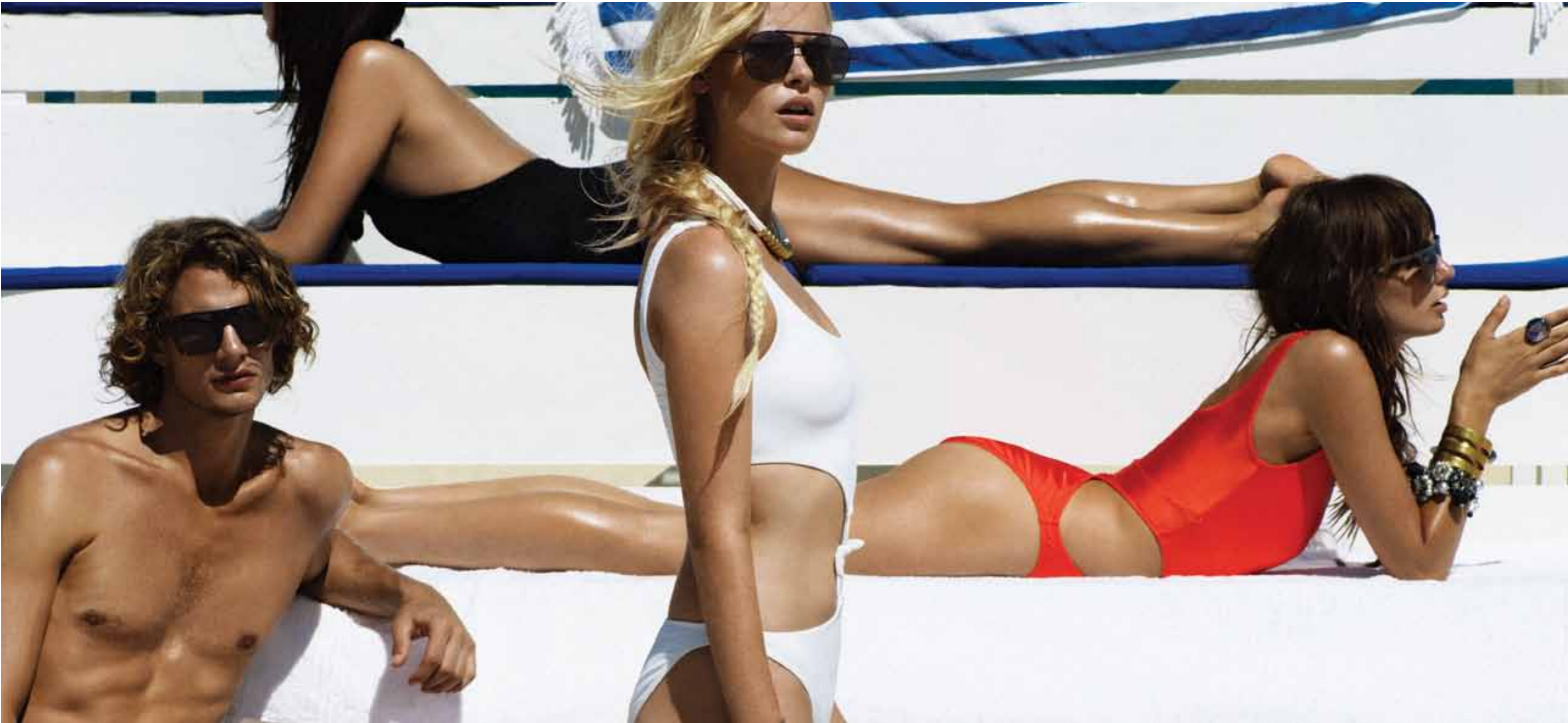
FROM LEFT: OVEREXPOSED | ACID DOUBLE | THE CROOK