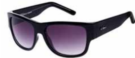
JETSON 09388026 BLACK KHAKI GRAD