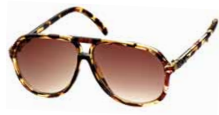
IN THE SKY 08823410 VINTAGE TORT BROWN GRAD