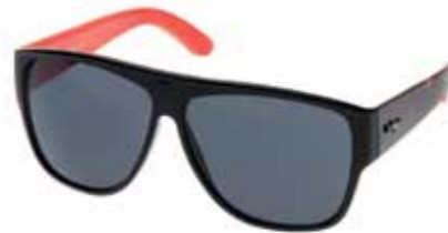
NU-RO SCENESTER 1002425 BLACK | ELECTRIC ORANGE SPLASH SMOKE MONO