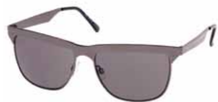
THE CROOK 1002419 GUNMETAL SMOKE MONO