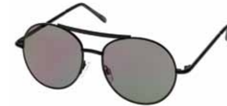
ACID DOUBLE 1002415 MATTE BLACK SMOKE MONO