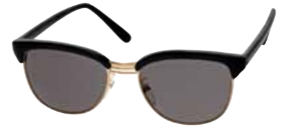
THE TUXEDO 08812011 BLACK | GOLD SMOKE MONO