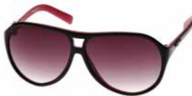
SAN JUAN 06637010 BLACK | MAGENTA WARM SMOKE GRAD