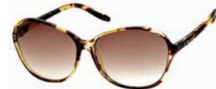
JOPLIN 08824410 VINTAGE TORT BROWN GRAD